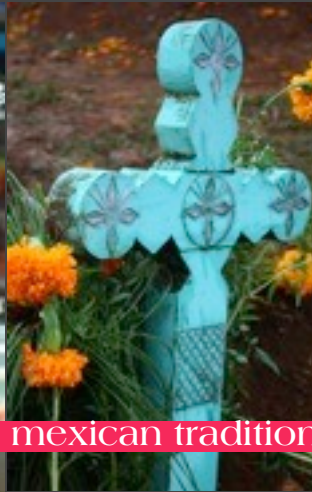
a mexican tradition

satiric way, through little skulls made of sugar or chocolate, hojaldras (typical seasonal sweet bread), decorated papers or the different reproductions of the skulls, it's always a devotional and important festivity in the Mexican culture. This year, some of the volunteers in Nataté got together to set the traditional altar, to show the cultural perspective of death through the creativity of the volunteers.